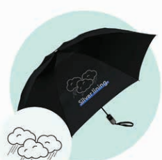
Silver Lining Umbrella $34.00