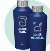
Half Full / Half Empty Water Bottle $34.00 / 20 oz $26.00 / 17 oz