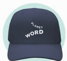
Navy Hat $20.00