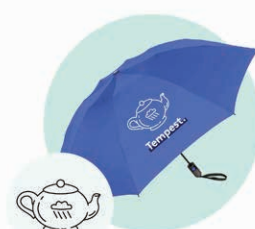
Tempest in a Teapot Umbrella $34.00