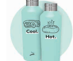
Cool as a Cucumber / Hot Potato Water Bottle $34.00 / 20 oz $26.00 / 17 oz