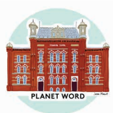
Sticker (4"x3") $5.00