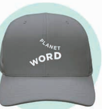
Gray Hat $20.00