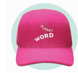
Fuchsia Hat $20.00