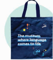
Canvas Tote $20.00