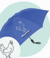
Foul Weather Umbrella $34.00