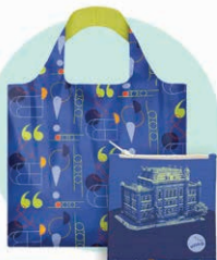
Franklin School Tote $16.00