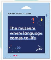
Magnet (3"x3") $5.00