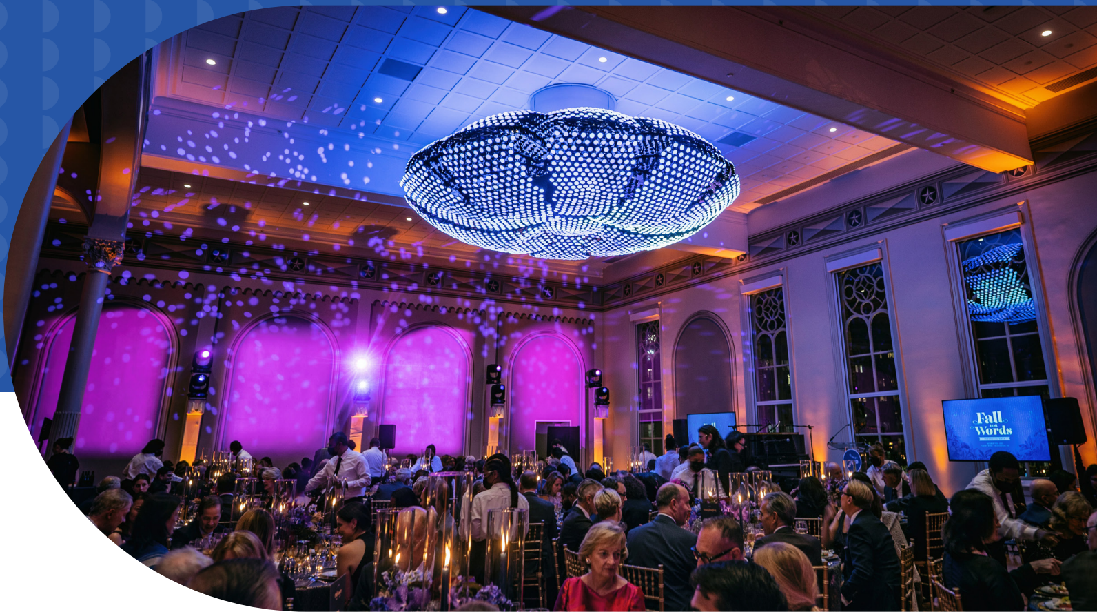
The first inaugural gala, "Fall for Words" in 2022