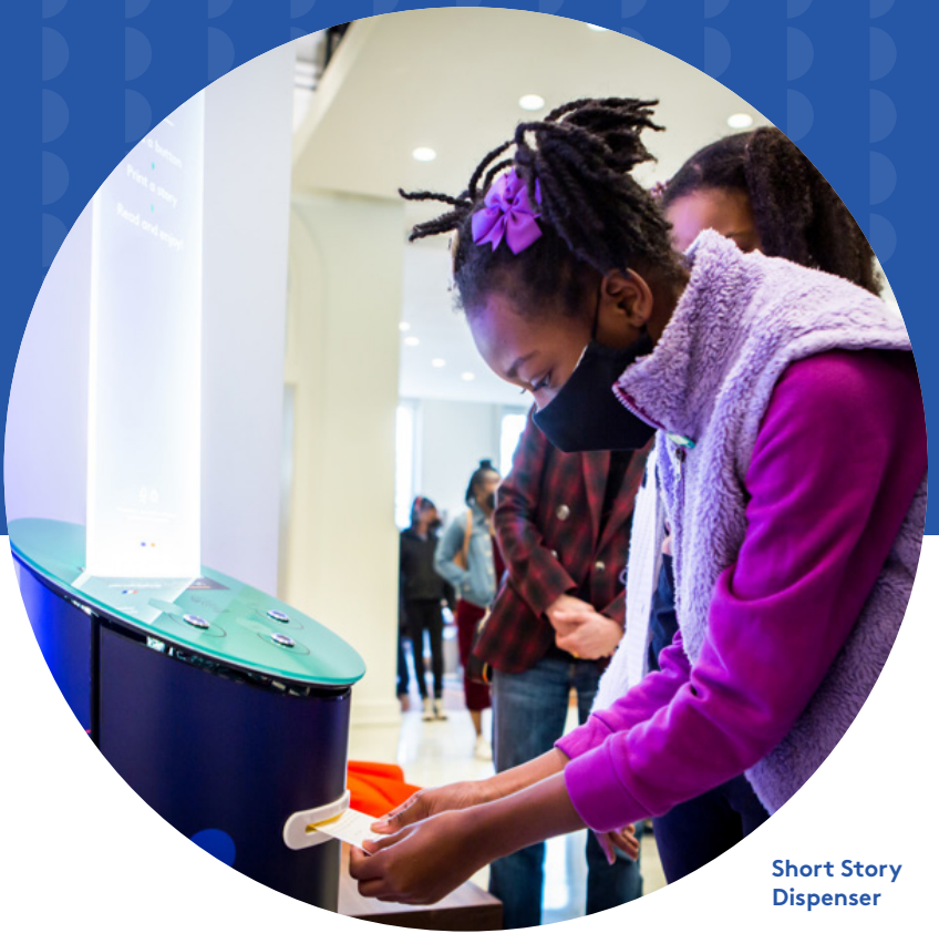
Short Story Dispenser

We want to tailor a membership that works especially for you. Corporate members are invited to customize their packages by adding: